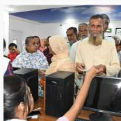
Seminars & Workshops