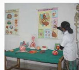
Rural Health Programmes